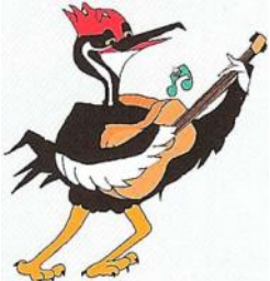
OUR FAVORITE NATIVE: PILEATED "WOODPICKER"

Always check our web site for current activities and schedules!!!